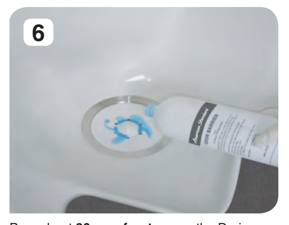
Pour about <u>30 oz. of water</u> over the Drain Insert. Then slowly pour the <u>entire contents</u> <u>of the Odor Barrier</u> onto the Drain Insert. Wipe clean. The American Standard Urinal is now ready for use.