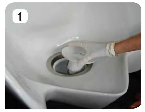
Take a new Drain Insert and place it in the waste trap.