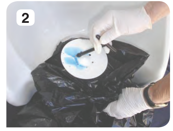
Dispose the Drain Insert and key in a plastic bag.