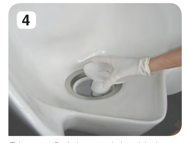
Take a new Drain Insert and place it in the waste trap.