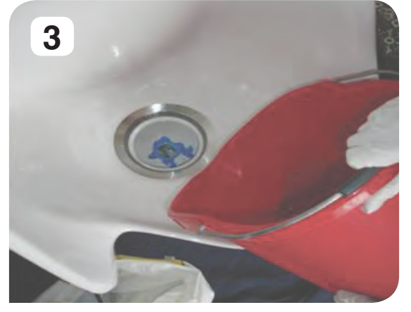
Rinse the trap with two buckets of warm water. If necessary, use a small brush around the stainless steel ring. Be careful not to scratch the ring.