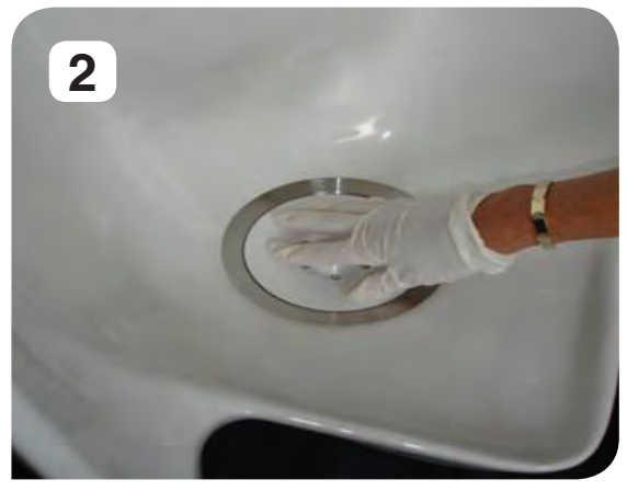
Press down on the drain insert until you feel and hear a slight popping sound. The insert must be tight.