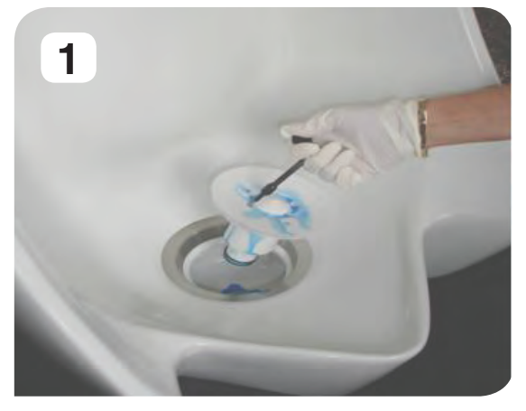
Screw the key into one of the holes of the Drain Insert and pull upward to remove. When insert is pulled the contents of the waste trap empties into the waste line.

After approximately 15,000 uses there will be a small amount of Blue Odor Barrier Liquid on top of the Drain Insert. This indicates it is time to change out the Odor Barrier Liquid and the Drain Insert.