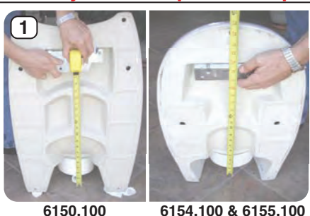
IF TEMPLATE NOT AVAILABLE:

Not recommended to install on any copper plumbing. CAUTION: DO NOT use pipe dope or plumber's putty - will cause housing failure. Warranty is void if plumber's putty or pipe dope is used for the housing connection.