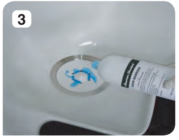
Pour about <u>30 oz. of water</u> over the Drain Insert. Then slowly pour the <u>entire contents</u> <u>of the Odor Barrier</u> onto the Drain Insert. Wipe clean. The American Standard Urinal is now ready for use.