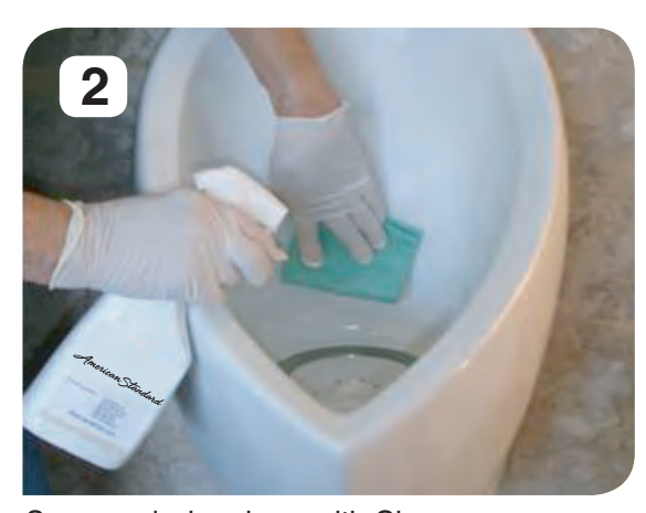
Spray and wipe down with Cleaner.