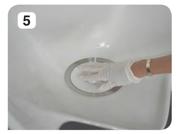
Press down on the Drain Insert until you feel and hear a slight popping sound. The insert must be tight.