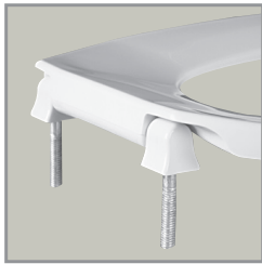
PLASTIC HINGES WITH STAINLESS STEEL POSTS AND PINTLES