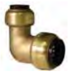
207-R C x C