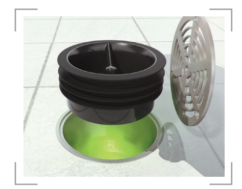
Simply insert the proper size Green Drain into the existing floor drain. Green Drains can be used in most commercial floor drains or directly into 2", 3", 3.5", or 4" pipe