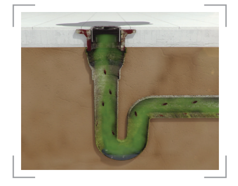
With the Green Drain installed, water flows down while bugs, odors, and sewer gases stay out.